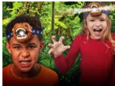
Inspiration for children's torch designs