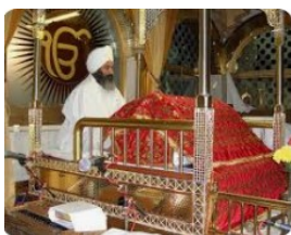
The Guru Granth Sahib