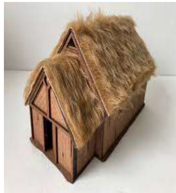
Example Anglo-Saxon houses