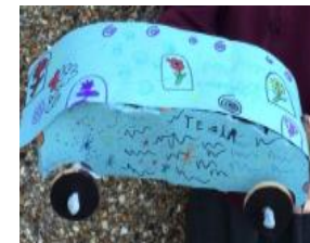
Decorating the car's body