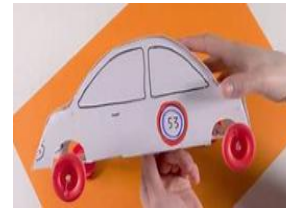
Building the car's body