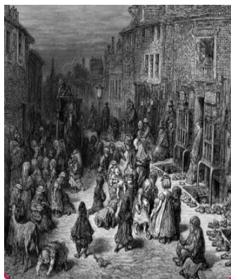
a Victorian slum