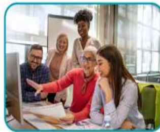
people at work