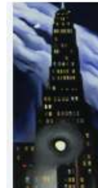
Ritz Tower, New York