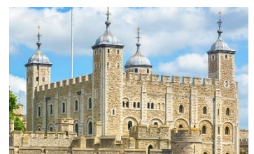
Tower of London