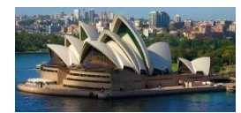
Sydney Opera House